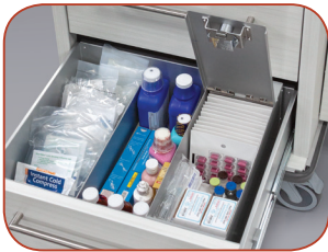
10" Narcotic Box*

* Included on all Vintage Medication Carts. VE3 & VE4 Models also include Slide-Out Surface, Waste/Lid. VE5 & VE6 Model includes Waste / Lid, Tracking Caster. For additional accessories see CapsaHealthcare.com