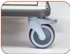
5" Brake Caster*