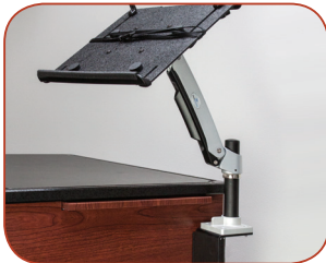
Laptop Arm & Tray