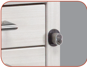
Core Removable Lock*