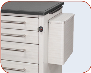
Waste With Lid